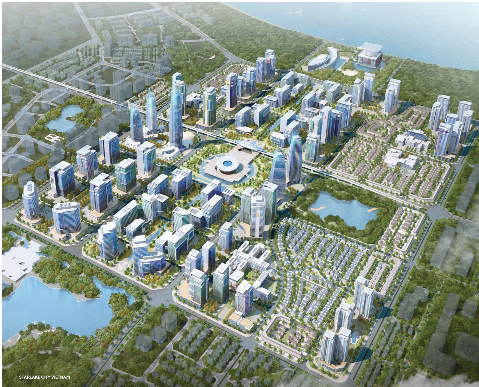
STARLAKE CITY VIETNAM