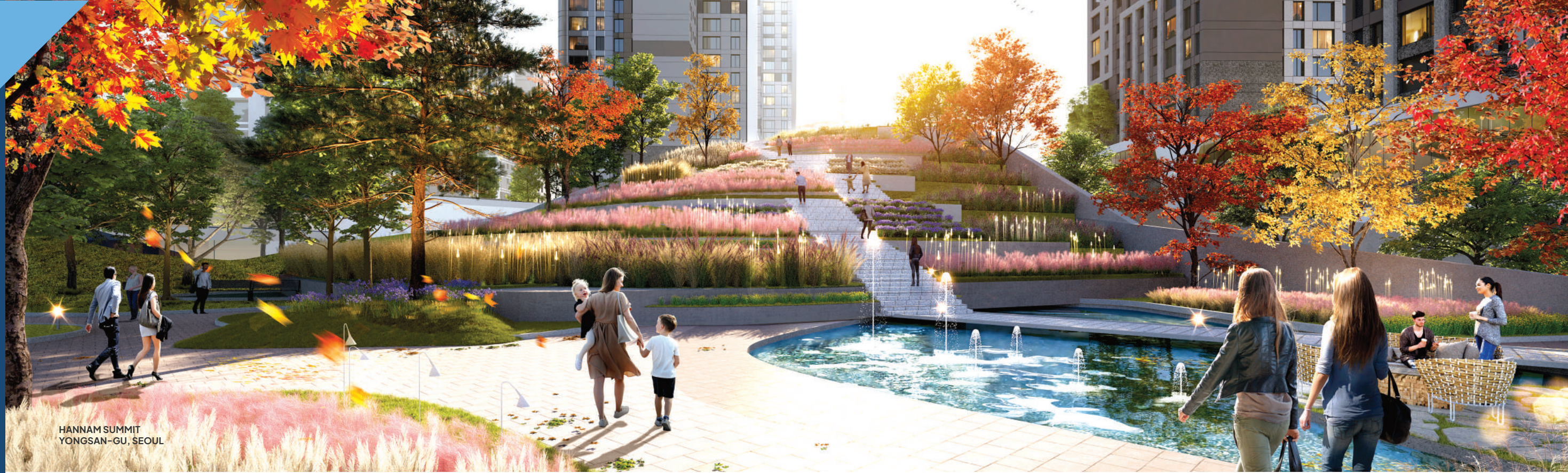
HANNAM SUMMIT YONGSAN-GU, SEOUL

Daewoo E&C Vina is trying its best to create corporate values to accompany a good future for mankind through the implementation of a sustainable development strategy.