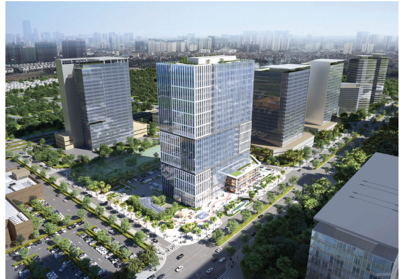
COMPLEX DEVELOPMENT PROJECT (OFFICE | RETAIL) STARLAKE BICC4