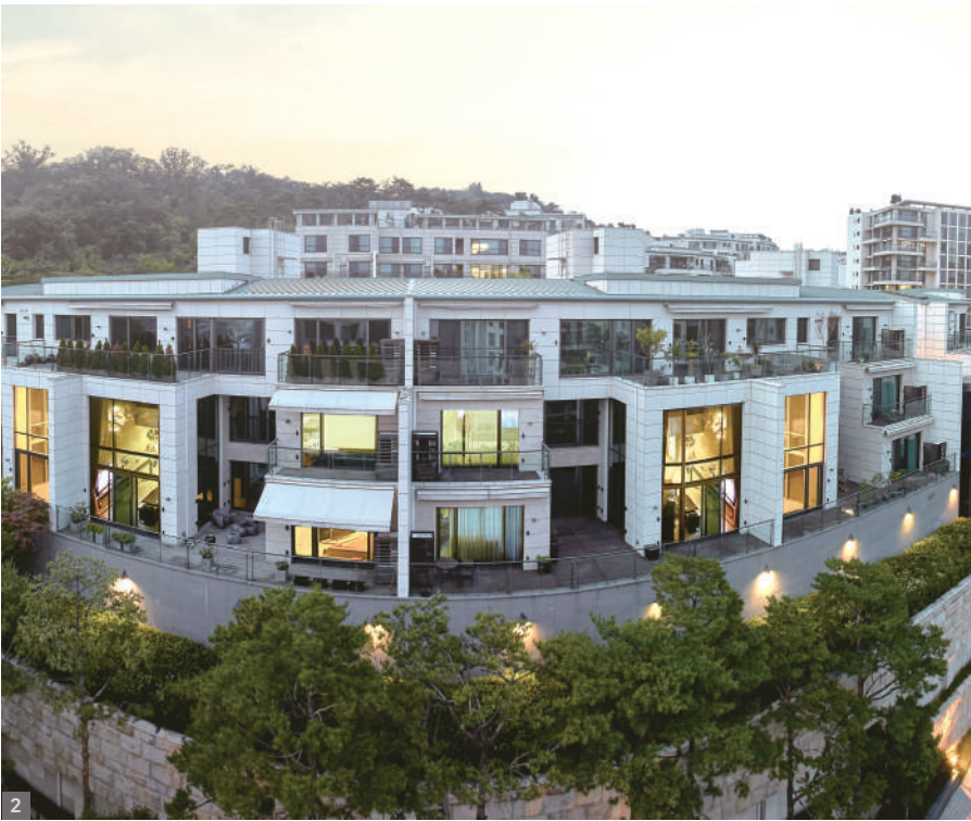
2 HANNAM THE HILL Floors 2/12, 7 apartment buildings, 600 households.